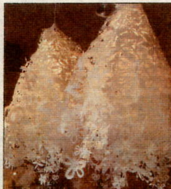
Tyvek goes from useful to beautiful in Midsummer Lights.