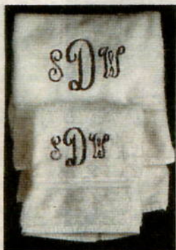
A set of six bath towels with free monogram from Horchow are spiffy at just under $50.